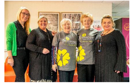
As well as each and every member of staff of the Primrose Breast Care Centre.